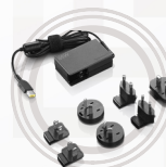
Lenovo 65W Travel AC Adapter