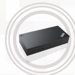
ThinkPad USB-C Dock