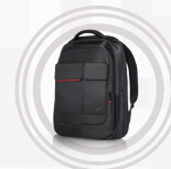
ThinkPad Professional Backpack