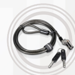
Microsaver DS Cable Lock